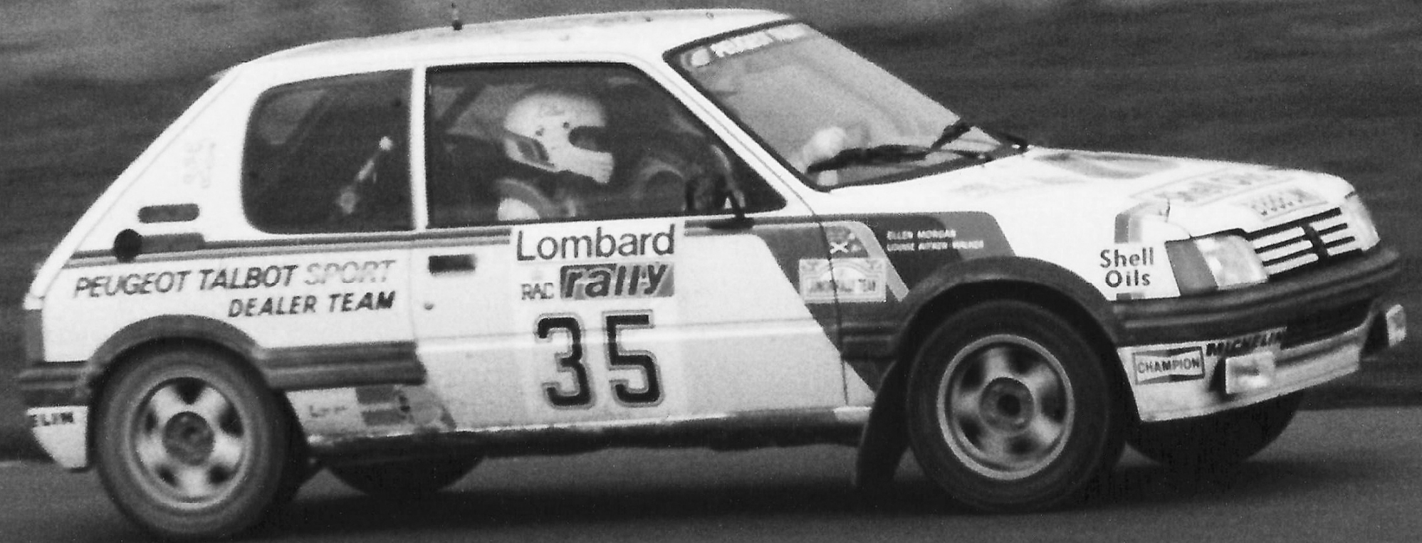
RAC Rally 1985

So many of our customers remember the 205 GTI fondly; for many, it was their first experience with a performance car. We feel so passionate about re-creating that initial emotion in the Tolman Edition 205 GTI. It's our way of celebrating the ultimate hot-hatch trailblazer and bringing it to a new generation of car enthusiasts.